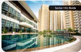
Sector 143, Noida

Gulshan ikebana 3 BHK homes @ sec. 143 noida