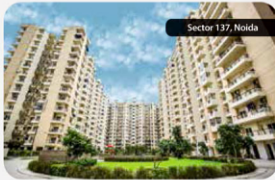
Sector 137, Noida