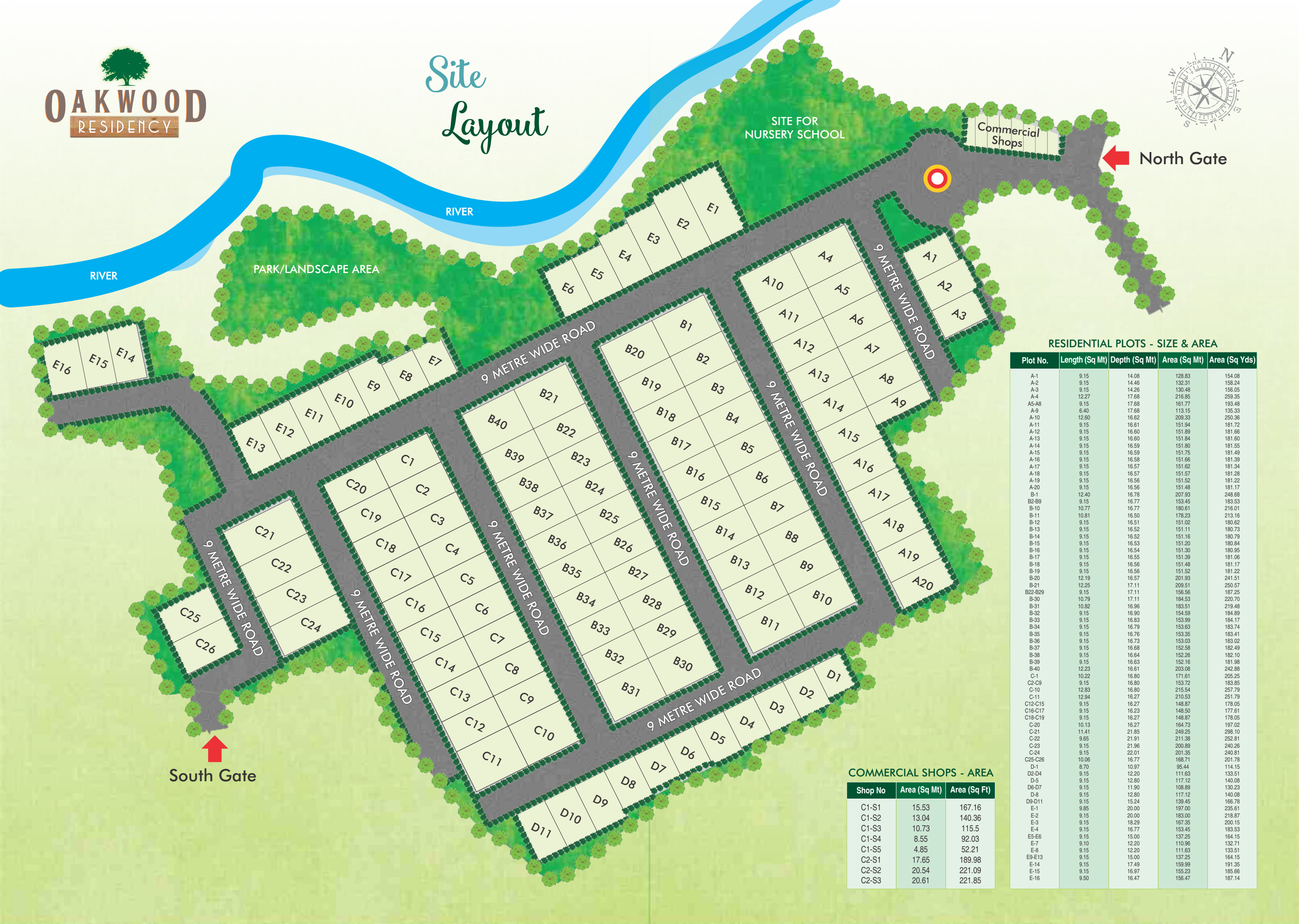
RESIDENTIAL PLOTS - SIZE & AREA